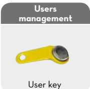
Code F15904000 (10 pcs)