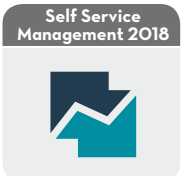
Software pag. 32