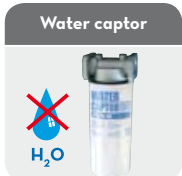
(only column versions)